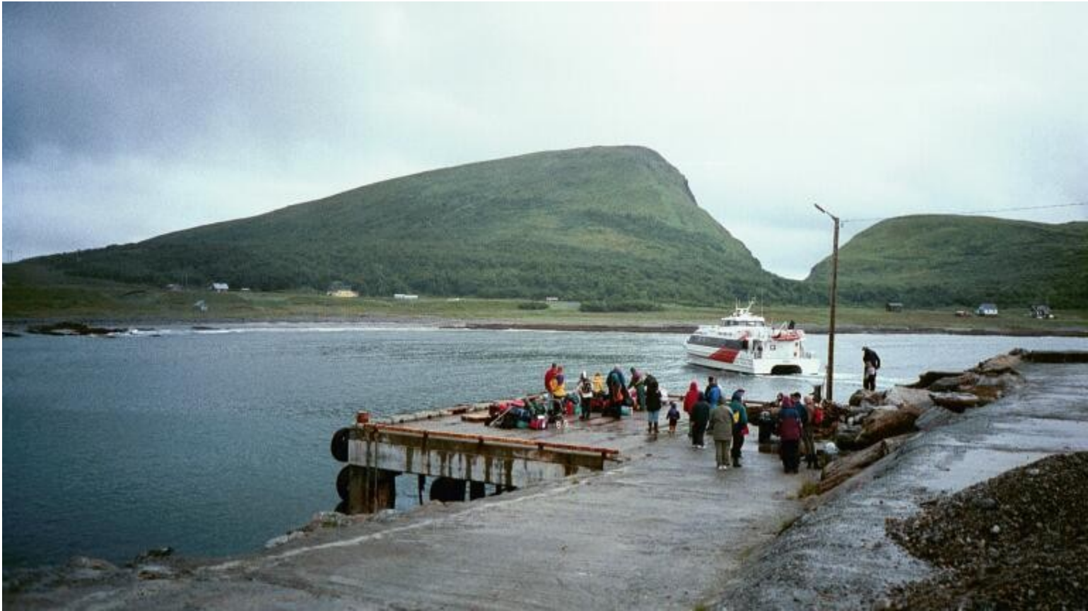
Westamaranen, the local ferry is arriving.