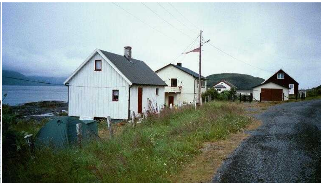
The houses at Loppa

The commemoration of fishermen who died at sea is located at the church.